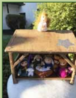
Nativity scene created by Sue P