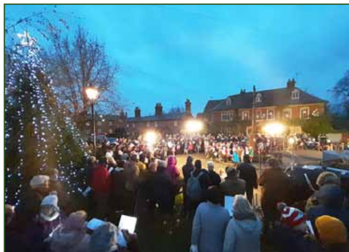
A sizeable crowd watched on at the open air nativity

Now with the winter festivities behind us, we can look forward to another