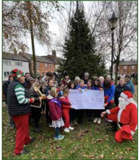
An early Christmas present: grateful recipients received a total of £8,000 from the DFG

Members of the DFG went around the village on the 12th and 13th of Decem-