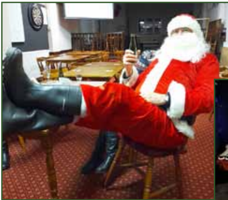
(above) Even Santa needs to take a break sometimes! (right) Santa back at work in his Winter Wonderland cabin

Christmas day. In the background, you could hear the wonderful tones of the Dunchurch Band and Dunchurch Voices who braved the cold and came along to provide