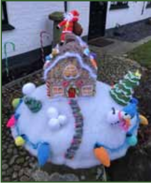
Gingerbread house created by Wendy